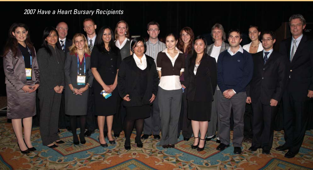
2007 Have a Heart Bursary Recipients